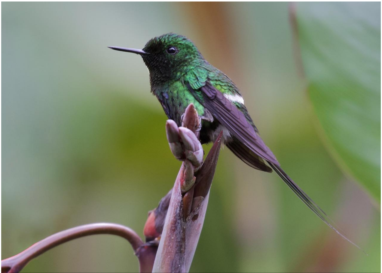
Green Thorntail

Often called "the Switzerland of Central America," Costa Rica is a small, stable country with a prosperous middle class, fine educational system, and spectacular highland terrain. For its size, it is one of the richest countries in the world for birds, with over 900 reported species from a small area the size of West Virginia. Costa Rica boasts the finest national park and reserve system in Latin America, protecting portions of all major habitats and the accompanying flora and fauna. Because of this, it has become one of the premier birding destinations in the world! This tour offers an excellent introduction to the joys of Neotropical birding, numerous regional