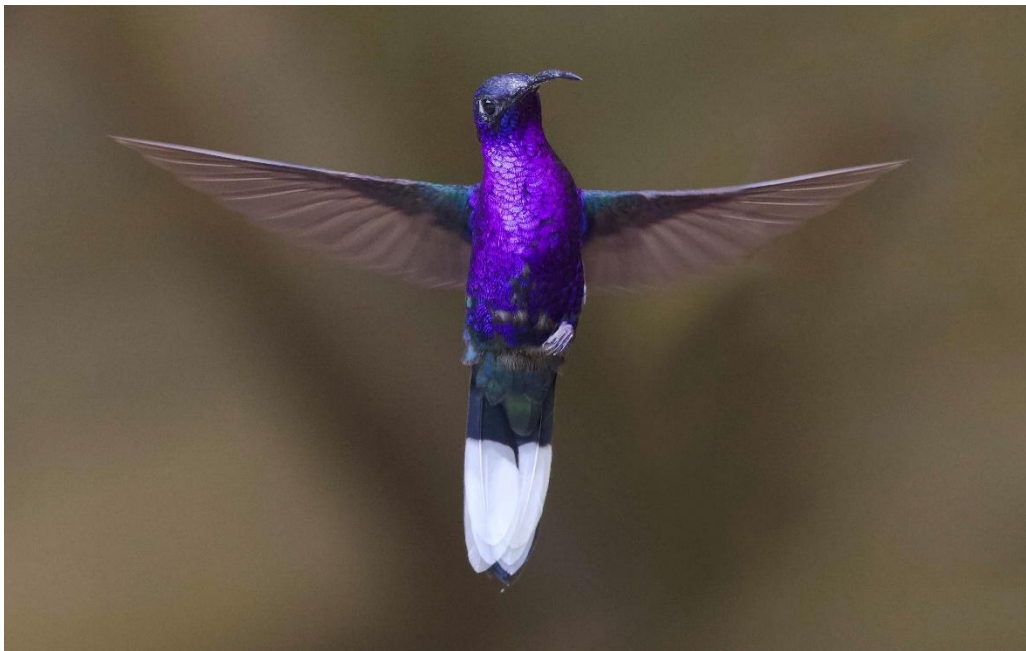
Violet Sabrewing.

The Costa Rican landscape is remarkably diverse, and each of the four major regions we will visit forms a natural boundary for bird distribution. The humid Caribbean lowlands and foothills are directly linked to the great lowland forests of South America, with many rainforest birds spilling across the Panama "land bridge" to reach their northern limit here. The Carara National Park located in the Pacific coast is an isolated area of high rainfall, and a number of species are found only here. Most importantly, much of Costa Rica consists of a large highland mass dominated by immense volcanoes and rugged cordilleras. The distinctive birdlife here is completely different from that of the lowlands and includes a high number of endemics (birds found nowhere else in the world except adjacent Panama).