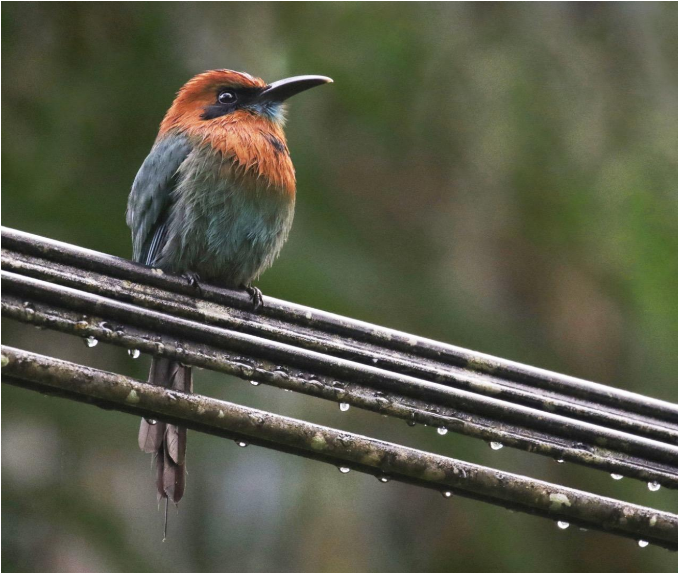
Broad-billed Motmot.

March 12, Day 13: Departure for Home. The tour ends this morning with a transfer to the San José airport for flights departing before noon today. Transfers for flights departing at other times can be arranged in advance at an additional charge. When booking your return flight please keep in mind that transfers will depart from the hotel three hours before the scheduled departing flight time. In other words, if you schedule an early morning flight, your departure from the hotel will be very early.